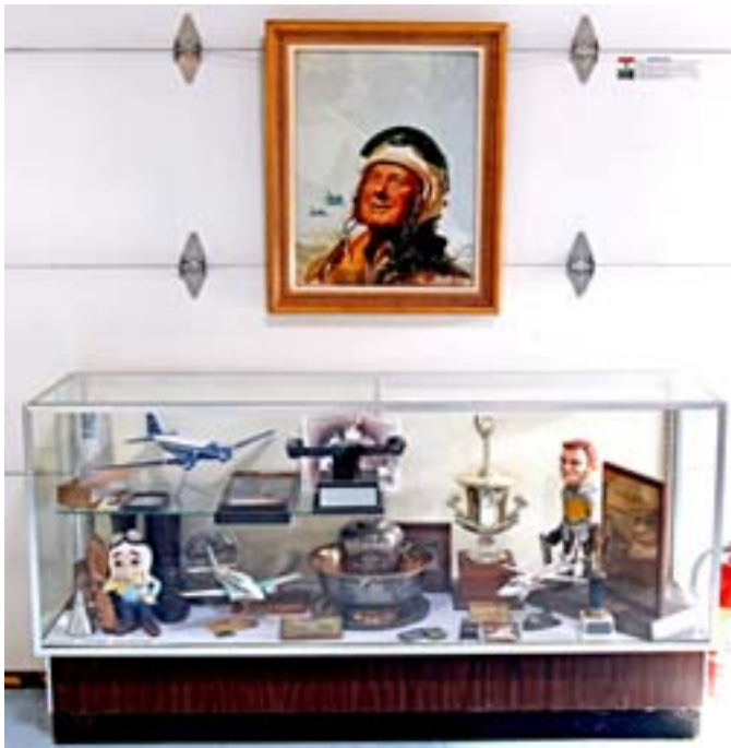
Exhibit GR-8 Arthur Godfrey

Radio and television entertainer Arthur Godfrey learned to fly in the 1930s. He strongly promoted to his middle-class fans affordable vacation in Hawaii and Miami Beach, Florida, formerly enclaves for the wealthy.