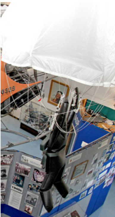
Exhibit GROG-6 Switlik D-Day Paratrooper Dummies