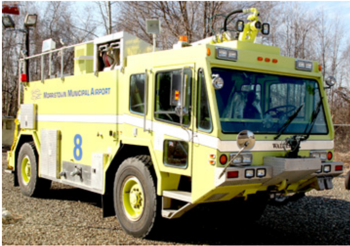
Exhibit BY-5 Walters Airport Rescue & Firefighting Vehicle

The two-bladed, single engine AH-1 was the backbone of the Army's attack helicopter fleet used in the Tet offensive in 1968 through the end of the Vietnam War. It provided fire support for ground forces. A notable feature was that the pilot's helmet was synchronized with the gun turret. [Site-map]