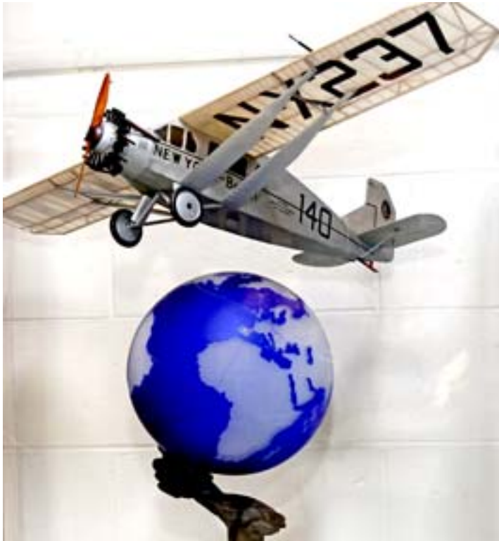
Exhibit GR-3 “Chamberlin’s Journey” Chamberlin was presented this glass globe sculpture by the Czechoslovakian government after his flight to Germany. [Site-map]

The first flight was on December 17, 1903 at Kitty Hawk, NC, by Orville and lasted 12 seconds covering a distance of 120 feet. There were a total of four flights that day with the final flight by Wilbur lasting 59 seconds and traveling 284 yards. [Site-map]