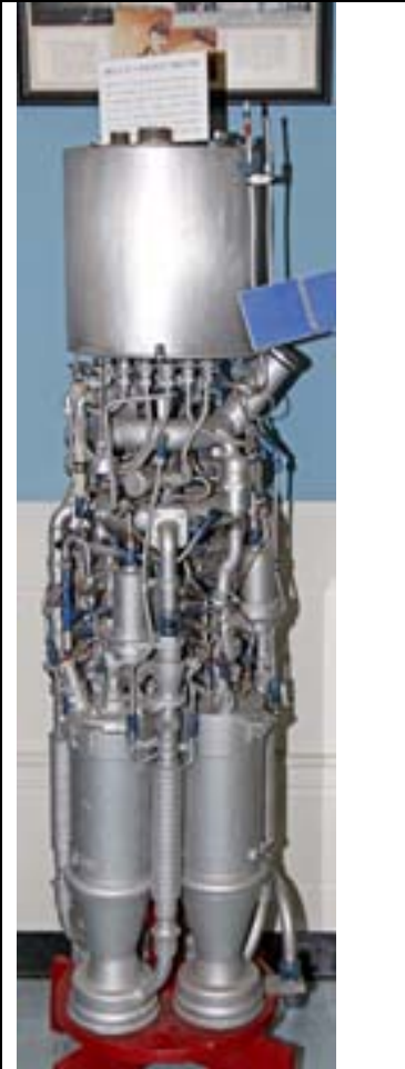
Rocket Engine for Bell X-1