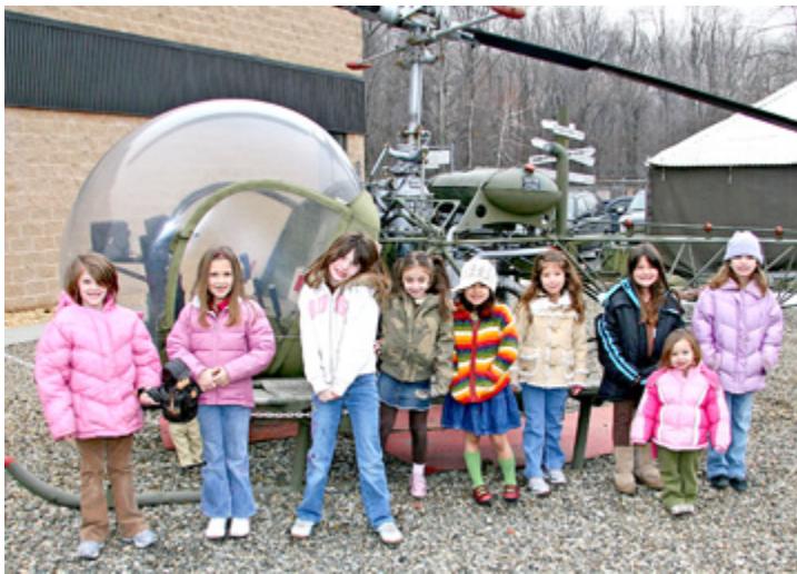
Exhibit BY-6 Bell 47

150-gallon foam tank (3% AFFF), carrying 150 ft. of 2-inch hose, 150 ft. of booster hose, an 800 g.p.m. roof-mounted stang gun. This was the purpose-built airport fire truck used by NJ's Morristown Municipal Airport. [Site-map]