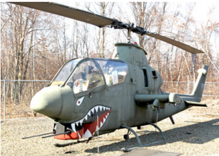
Exhibit BY-4 Bell AH-1 Cobra Our attack helicopter flew actual combat missions during the Vietnam War. The type's first flight was September 7, 1965 and was then introduced in 1967. Of the 1,110 AH-1's delivered from 1967 to

1973, approximately 300 were lost to combat and accidents.