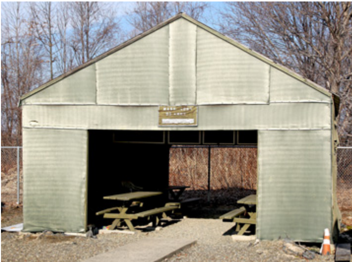
Exhibit BY-3 Lunch area

TWA and Northwest were its initial customers but eventually sold their Martin 202's to California Central and Pioneer Airlines. Later Allegheny Airlines acquired a total of 18. After Allegheny, this aircraft was used for private charter service, for the Herman's Hermits rock band, etc. This is the only Martin 202 to survive. [Site-map]