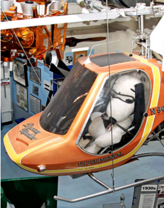
Exhibit GROG-5 Scorpion Experimental Helicopter

with TIROS-1 in 1960. TIROS was the first satellite that was capable of remote sensing of the Earth. [Site-map]