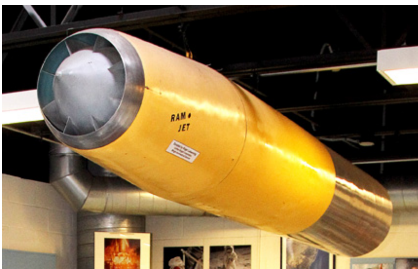
Exhibit GROG-8 Curtiss Wright Ramjet