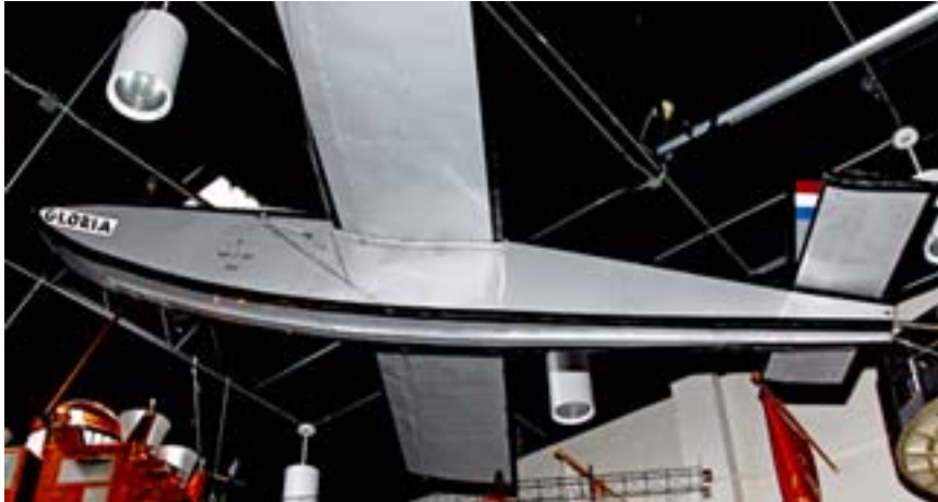
Exhibit GROG-7 Rocket Powered Mail Plane

and story about Switlik Corp. and Stanley Switlik, parachute pioneer. [Site-map]